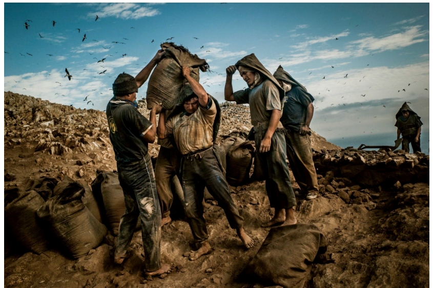
Guano extraction in Peru

T he chapter on “Machinery and Large-Scale Industry” in the first volume of Karl Marx’s Capital closes with this statement: “All progress in capitalist agriculture is a progress in the art, not only of robbing the worker, but of robbing the soil.... Capitalist production, therefore, only develops the techniques and the degree of combination of the social process of production by simultaneously undermining the original sources of all wealth—the soil and the worker.” “Robbing the worker” referred to the theory of exploitation, which entailed the expropriation of the worker’s surplus labour by the capitalist. But what did Marx mean by “robbing the soil”? Here robbery was connected to his theory of the metabolic rift arising from the expropriation of the earth. As he stated earlier in the same paragraph, “capitalist production...disturbs the metabolic interaction between man and the earth, i.e. it prevents the return to the soil of its constituent elements consumed by man in the form of food and clothing; hence it hinders the operation of the eternal natural condition for the lasting fertility of the soil.” 1