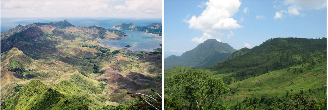
Fig. 6: Right: Tropical islands such as Anjouan in the Comoros, have suffered extensive deforestation for agriculture. Native vegetation is generally completely lacking at lower altitudes, and the highest ridges and mountaintops are now the last refuges of the remaining extant endemic species. Left: Other islands such as Rapa in the Austral Islands, French Polynesia, which has an area of only 40 km 2 and used to have more than 100 endemic land snail species, 59 endemic plant species and 67 endemic weevil species, are now mostly barren. Fires and overgrazing by introduced herbivores have destroyed much of the upper elevation habitat, and the vegetation at lower altitudes is dominated by invasive species.