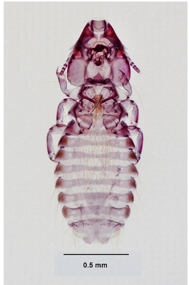
Fig. 3: Parasites, such as this louse (Phthiraptera, Rallicola pilgrimi Clay, collected June 2014, South Island, New Zealand), which went extinct when its host, the little spotted kiwi ( Apteryx owenii Gould), was transferred to predator-free islands (Buckley et al., 2012), and which is not on the Red List, are almost completely unknown in the assessment of extinctions.

In attempts to surmount this apparently intractable invertebrate problem, Régnier et al. (2009, 2015a, 2015b) and Cowie et al. (2017) focused on molluscs. Molluscs are a reasonably well-known group of invertebrates, which makes them valuable from the perspective of extrapolating extinction rates to biodiversity more broadly. They constitute the second