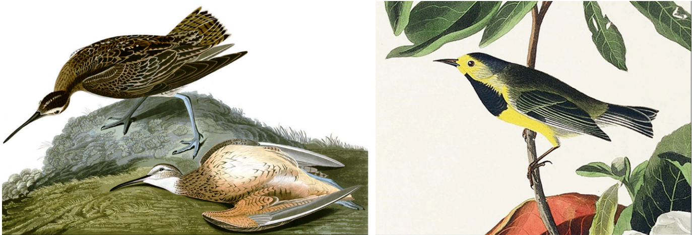
Fig. 2: Extinct but not listed as such, for fear of committing the 'Romeo Error'. Left: Eskimo curlew ( Numenius borealis (Forster)), from Audubon (1827–1838: plate 208; Wikimedia Commons). Right: Bachman's warbler ( Vermivora bachmani (Audubon)), from Audubon (1827–1838: plate 185 (detail); Creative Commons, Rawpixel).