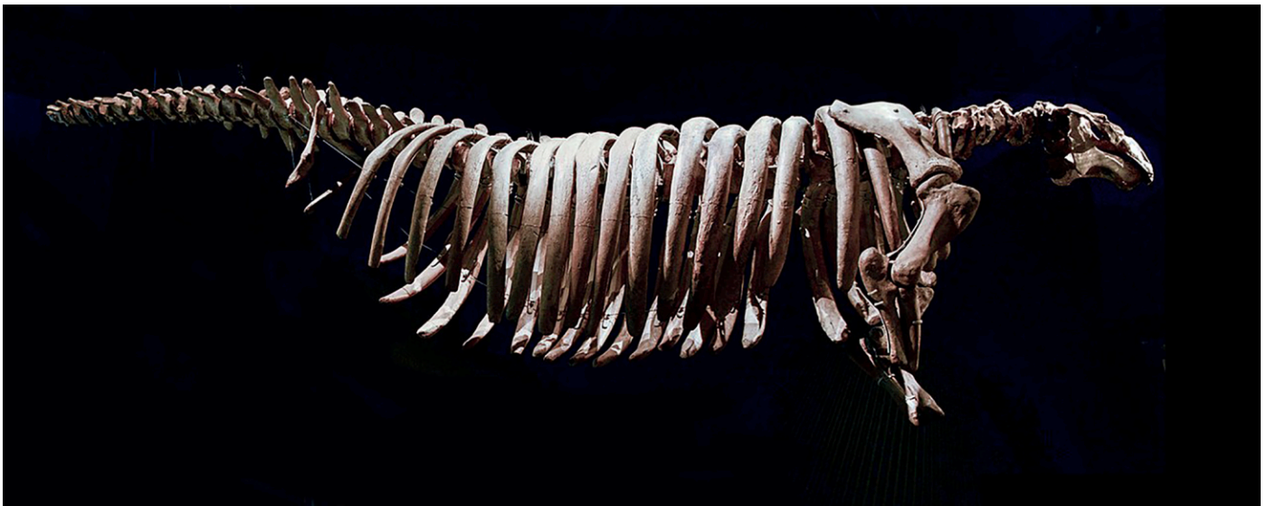
Fig. 6: Steller's sea cow ( Hydrodamalis gigas (Zimmerman)), one of the few documented marine extinctions, skeleton in the Musée des Confluences, Lyon.

Roberts & Hawkins (1999, p. 245) argued that “there are several reasons to suspect that many marine extinctions have gone unnoticed”, an assertion with which we agree. But we do not share their judgement that “compared with terrestrial ecosystems, the sea has been far less studied and the historical baseline of information tends to be brief. It is harder to sample marine ecosystems” (p. 245); whereas their statement that “our taxonomic knowledge of many groups remains fragmentary” (p. 245) applies just as well to most non-marine invertebrate groups.