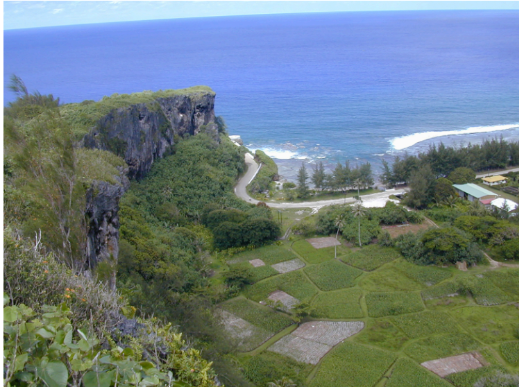
Fig. 5: Rurutu (Austral Islands, French Polynesia) was once home to 19 species of endemic Endodontidae (Mollusca). Despite extensive searches in the remaining patches of native vegetation, such as at the foot of this cliff, only empty shells were found. All 19 species are now considered extinct.

Arguments surrounding the question of whether current extinction rates are artificially high depend on an assessment of the background rate of extinction. Since Pimm et al. (1995) introduced the E/MSY metric (number of extinctions per million species-years), this statistic has been used frequently to describe the background rate, with most authors reaching estimates of 0,1–1 E/MSY (Ceballos et al., 2015), with some suggesting that typical rates may be closer to 0,1 E/MSY (De Vos et al., 2015; Lamkin & Miller, 2016; Pimm & Raven, 2019). However, based on mammals, Ceballos et al. (2015) estimated a background rate of ~2 E/MSY. Nonetheless, Briggs (2016, 2017) preferred to use a Pleistocene background