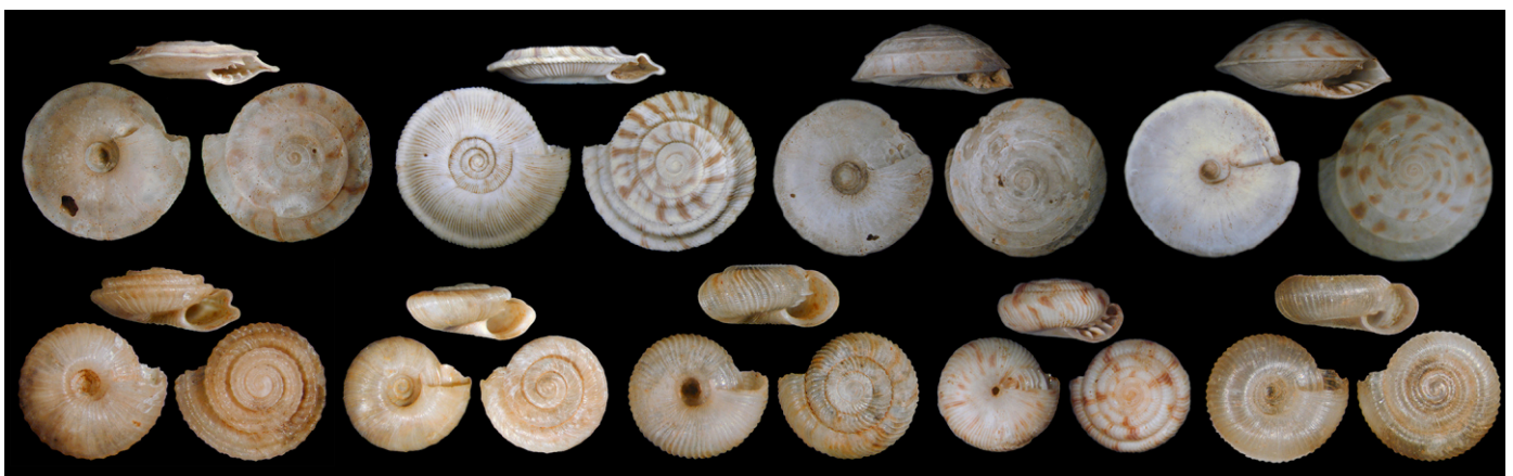
Fig. 4: Recently extinct Endodontidae from Rurutu (Austral Islands, French Polynesia). Photographs: O. Gargominy, A. Sartori (Muséum national d'Histoire naturelle, Paris).