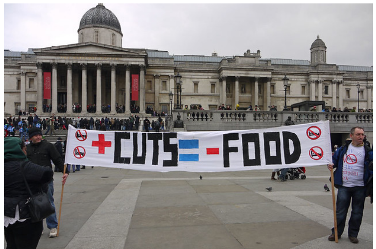
Photo: Bedroom Tax protest Trafalgar Square.

W elfare systems across the OECD face many combined challenges, with rising inequality, demographic changes and environmental crises likely to drive up welfare demand in the coming decades. Economic growth is no longer a sustainable solution to these problems. It is therefore imperative that we consider how welfare systems will cope with these challenges in the absence of economic growth. We review the literature tackling this complex problem. We identify five interconnected dilemmas for a post-growth welfare system: 1) how to maintain funding for the welfare system in a non-growing economy; 2) how to manage the increasing relative costs of welfare; 3) how to overcome structural and behavioural growth dependencies within the welfare system; 4) how to manage increasing need on a finite planet; and 5) how to overcome political barriers to the transformation of the welfare state. There is now need for further research investigating the macro-economic dynamics of post-growth welfare systems; trialling preventative, relational, low-resource models of welfare provision; and seeking to better understand political barriers to a post-growth welfare transition. We also make the case for considering post-growth welfare studies as a field in its own right, with the aim of improving coherence and cross-fertilisation between disciplines.